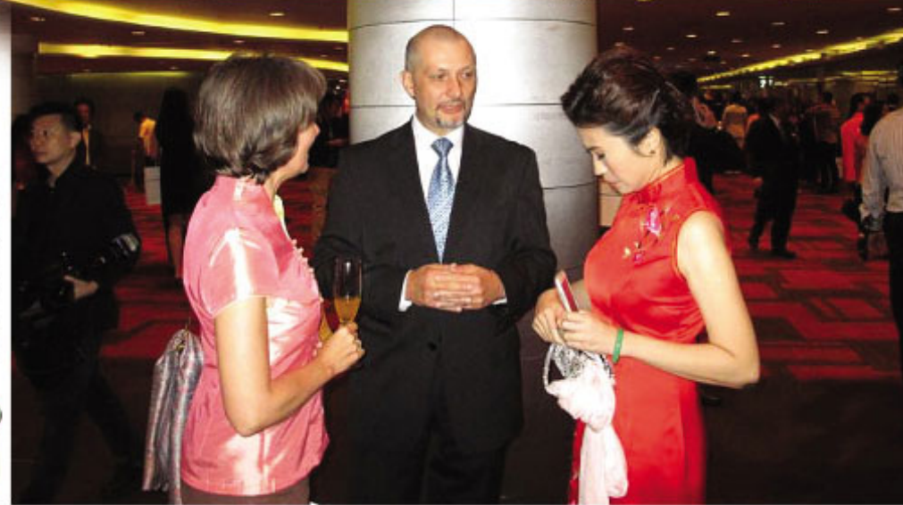
中小企业协会 (SMEAM) 举办的2015年中小企业卓越成就奖评选活动，吸引了众多业者的参与。

中小企业协会 (SMEAM) 成立于1988年，是马来西亚最大的中小企业组织。协会致力于为中小企业提供培训、咨询、融资及市场推广等服务，以促进中小企业的成长与发展。协会还定期举办各种行业论坛、研讨会及展览活动，为中小企业搭建交流与合作的平台。