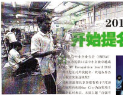
Hiring foreign workers is important to encourage and support the growth of the country's economy.

Our government should take the role of foreign workers very much more seriously. They are the backbone of our economy. It is not only a matter of labour supply and demand, but also a matter of economic growth and development.